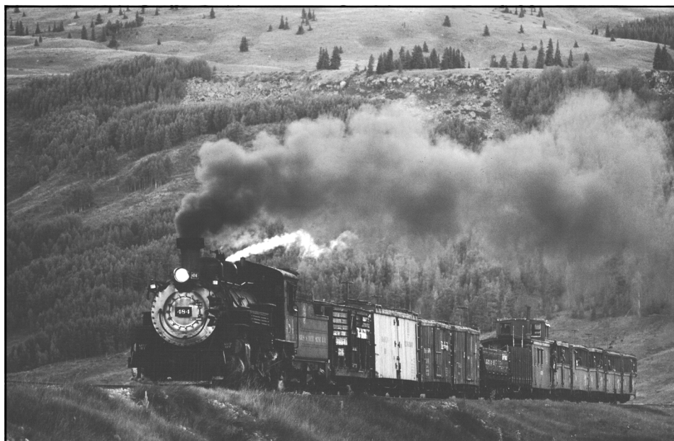
Your editor photographed this September 1985 excursion on the Cumbres & Toltec Scenic RR near Los Pinos Bridge.

The new caboose windows have been glazed. All the caboose upholstery has been sent out to be recovered. New