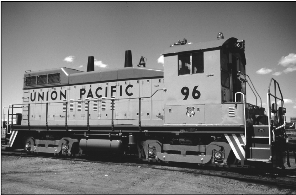
Union Pacific's steam crew at Cheyenne, WY, now have their SW-10 shop engine repainted and renumbered to #96. Don Zimmerman photographed it on 4-17-98 in its fresh coat of paint. UP #96 was formerly UP 1243.

the load out. This service continues today and is expected to continue for another month or so. Asarco is looking for another load-out site and when it is found and established, the UP will discontinue the local west of Canon City.