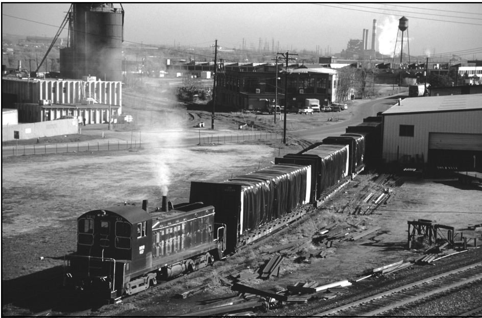
Denver's small switching railroad, the Denver & Rock Island Railway (DRIR), is seldom seen operating. It operates the Denver Stockyard and the old Rock Island industrial tracks around Locust St. and 48th Ave. The DRIR NW-2 #417 came from the Burlington Northern, and is the ex-Frisco #417. The 417 was working a cut of loaded lumber cars on 4-28-98 along National Western Drive.